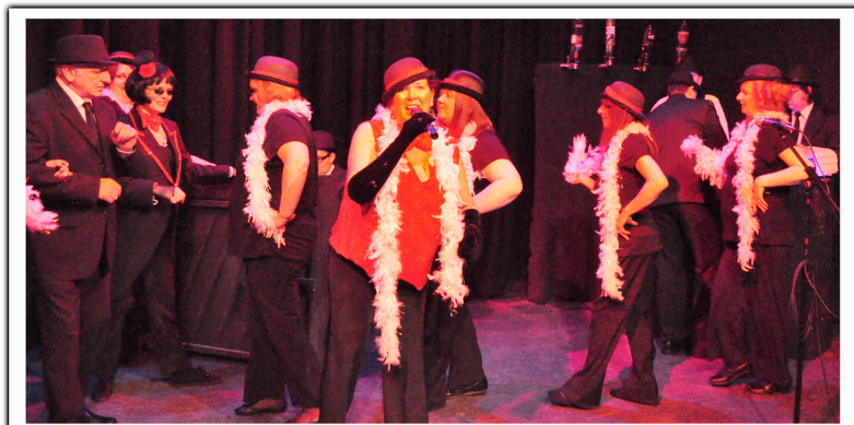
Star Struck Cabaret