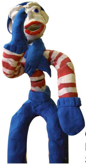
Character Mischief Makers Stobhill Hospital

A multidisciplinary 14 week workshop which included an introduction to drama, film making, animation, visual art, digital sound production and empowerment exercises. The high quality creative output of this workshop also featured in a exhibition we held in HMP Barlinnie called "5 Year Stretch" which displayed work from the past 5 years within HMP Barlinnie.