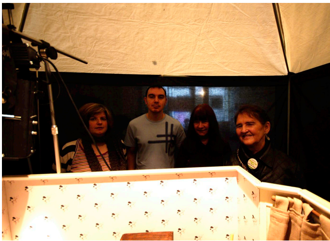
Participants of the Animation Project

A small group at Theatre Nemo embarked on a long-term project to script, build and film an animated film centring on the theme of depression. The group consisted of five core members including a couple whom have taken part in previous animation workshops through Theatre Nemo. The overall level of quality is outstanding and because of the attention to detail given to the set design and filming, the project is now being outsourced with the workshop facilitator and work is still in progress.