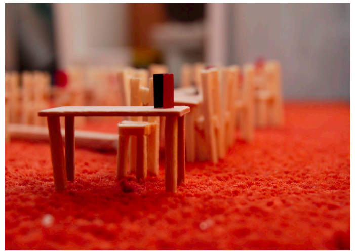
High attention to detail on a very small scale