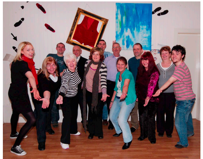
Lauren Laverne (far left) visits Theatre Nemo