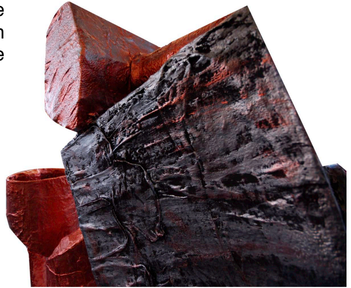
Sculpture Untitled Exhibition HMP Barlinnie